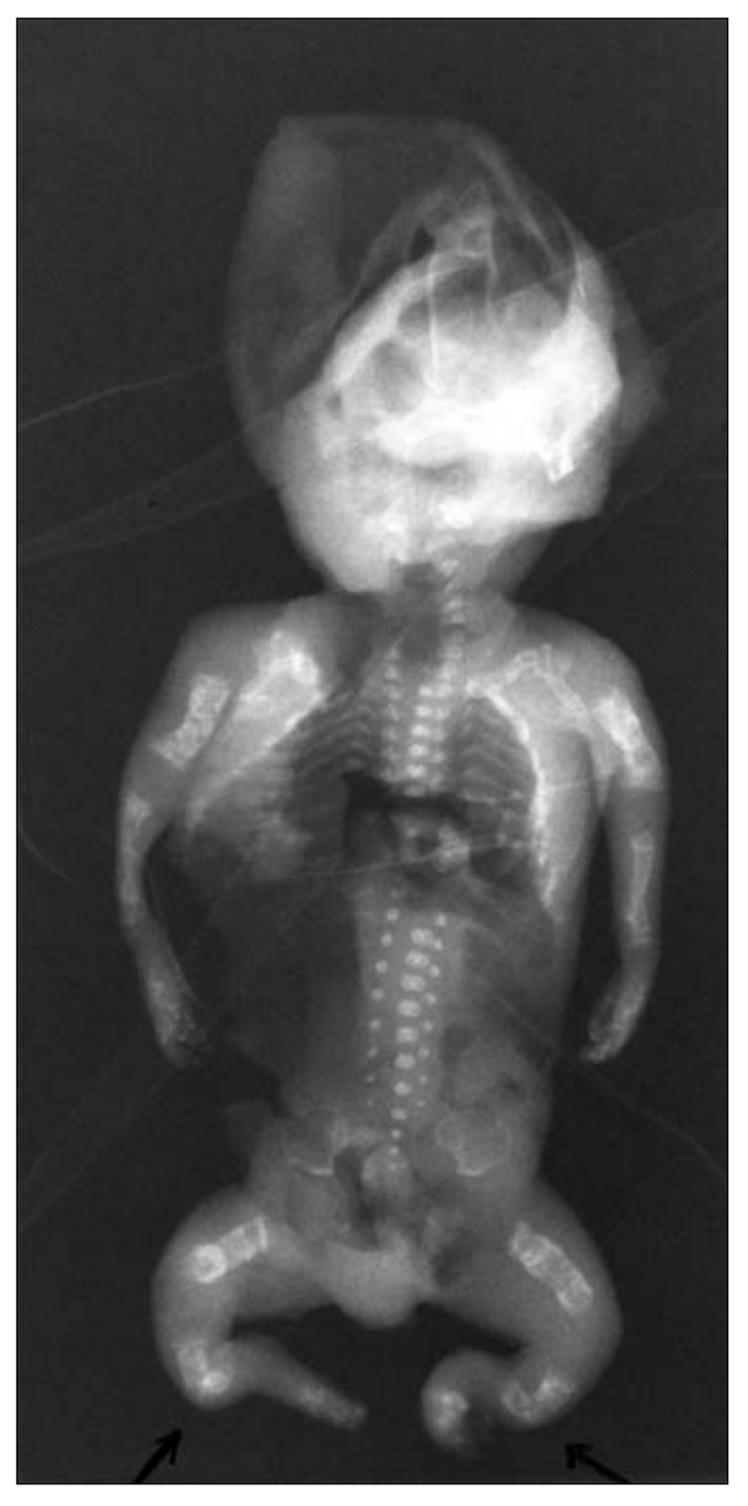
Figure 4. Postmortem X-ray shows the fetus with osteogenesis imperfecta type II, with short and bowed long bones crumpled by innumerable fractures and general undermineralization.

the result of a sporadic new mutation. Recurrence (6-7%) is usually due to parental mosaicism, even though, in a small number of families, autosomal recessive inheritance has been observed (3). It is characterized by early prenatal onset of severe bone shortening and bowing of the long bones due to multiple fractures, poor demineralization of the skull, narrow and bell-shaped chest caused by fractures of the ribs, abnormal skull shape, and abnormal face. Findings of associated polyhydramnios and chest compression (indicated by a relatively high cardio-thoracic ratio) and associated nonspecific abnormalities (such as hydrops) on ultrasound signal a poor prognosis. Death occurs either prenatally or shortly after birth owing to respiratory failure. Chorion villous sampling and DNA analyses or demonstration of abnormal collagen production can make the prenatal diagnosis in high-risk pregnancies (4). However, the diagnosis is usually made by routine ultrasound examination in midpregnancy, since the majority of the affected pregnancies are the result of sporadic mutations of an autosomal dominant gene. Osteogenesis imperfecta type III is less severe than type II and usually presents as multiple fractures at birth. Osteogenesis imperfecta type IV is the mildest form and is not detectable prenatally.