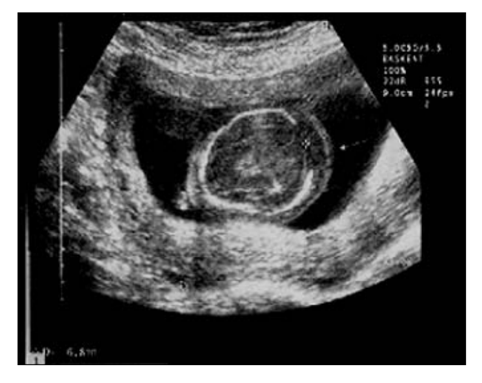
Figure 1. Ultrasound appearance of fetal nuchal edema.

A 32-year-old, gravida 3, para 1, abort 1 woman started to visit our antenatal clinic in the first trimester of her third pregnancy. Her husband was 36 years old, and they had no consanguinity. The woman's obstetric history was significant. Her first pregnancy in 1992 had resulted in a birth of a girl with cerebral palsy of unknown etiology. This infant was delivered at term by cesarean section. The woman had also had an abortion at 2 months gestation in 1999. Her medical and family histories were unremarkable. At 12+5 weeks of gestation, the crown-rump length (CRL) was 63.2 mm, and the NT thickness was 2.7 mm. The estimated risk for trisomy 21, calculated by a combination of maternal age, NT and, first trimester maternal biochemistry was 1/868. At the 16th week