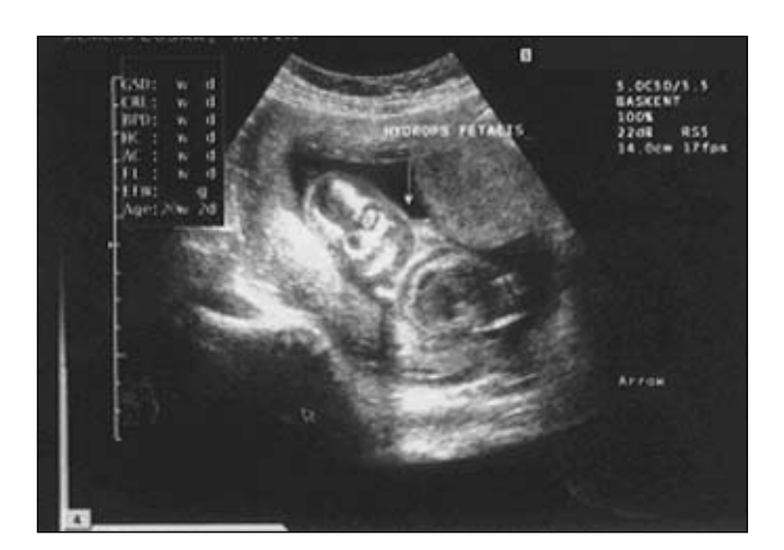
Figure 2. Ultrasound appearance of hydrops fetalis.

Osteogenesis imperfecta is a genetically heterogeneous group of disorders presenting as fragility of bones, loose joints, blue sclerae, and growth deficiency. A dominant negative mutation affecting COL1A1 or COL1A2 alleles, which encode the proa1 (I) and proa2 (I) chains of type-I collagen (a protein of paramount importance for normal skin and bone development) is the main underlying defect. There are 4 types. Osteogenesis imperfecta type I does not present prenatal deformities, and the diagnosis is made after birth. It is an autosomal dominant condition. Osteogenesis imperfecta type II is the most severe form with a birth prevalence of 1 in 60 000, which usually appears as