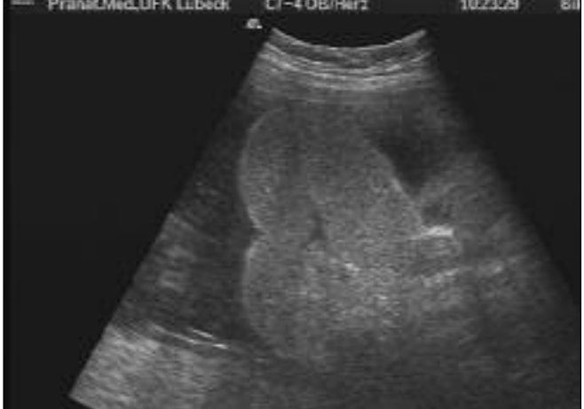
Figure 2 and 3. Sonographic image of fetal gastroschisis with dilated intra-and extraabdominal bowel loops in the third trimester.