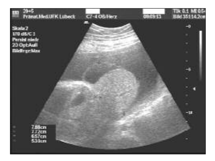
Figure 1. Sonographic image of fetal omphalocele with liver and bowel content at 29±5 gestational weeks.

fascial closure was performed. In 2 cases (13.33%), the omphalocele repair was performed by secondary fascial closure. The premature infant delivered in the 26<sup>th</sup> week of gestation was not operated due to the poor status. All the other 3 infants who had severe heart malformation (double outlet right ventricle, tetralogy of Fallot, and anomalies of caval veins with pulmonary hypertension and atrial septum defect type II) died. The average length of hospitalization was 38 days, although the difference was not statistically significant for children delivered by caesarean section. Only five children necessitated reintervention, in one case for intestinal