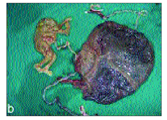
Figure 2. Monchorionic triamniotic triplet with co-triplet anencephalic fetus ultrasonographic image (a) and postnatal photography (b). Bipolar coagulation site of the umbilical cord (arrow).