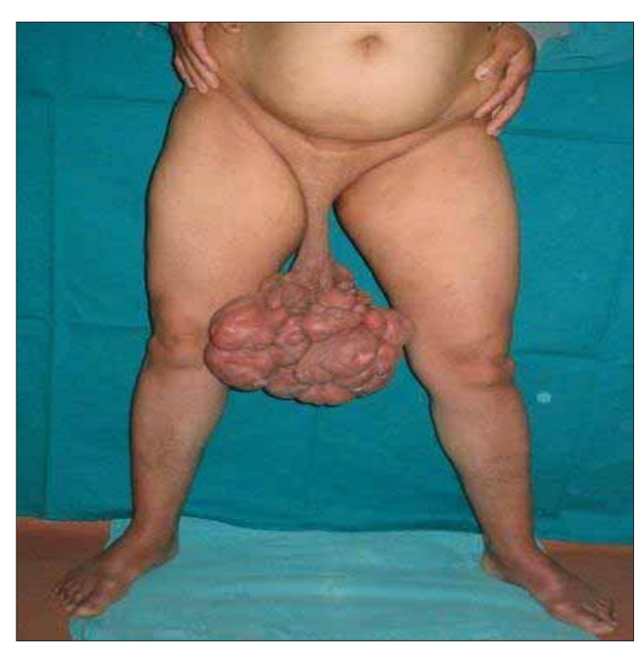
Figure 1. Patient at presentation, showing large mass hanging from thick pedicle and impeding walking