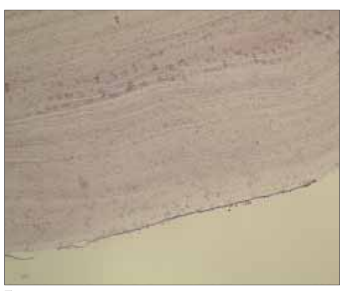
Figure 2. The wall of the hydatid cyst. Note the fibrolamellary membrane and the inner germinative layer. HE,X50

Only a few cases of primary pelvic hydatid cyst have been reported (1, 4-7) and primary pelvic involvement is exceedingly rare. In the presented case, the absence of cysts in other organs was clearly demonstrated by exploration of the abdomen and imaging techniques, and isolated pelvic hydatid cyst was confirmed. Additionally, in our case, as a unique finding, the patient was 76 years of age, older than the previously reported cases in the literature.