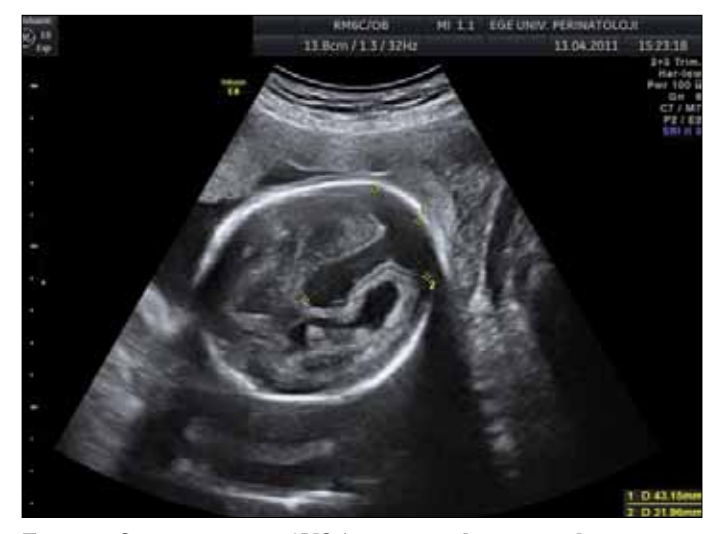
Figure 1. Cystic structure of VGA in gray scale sonography

Biometric parameters were all compatible through the first trimester sonographic examination. Mild hydramnios and significant cardiomegaly were noted. Although the patient's screening test for gestational diabetes was positive, the diagnostic test was negative and the Hb_{ALC} level was within the normal range. The cardiac structures were normal on echocardiographic examination; however, compartments such as the aorta, pulmonary artery, and both ventricles were dilated and the heartto-thorax ratio was increased. Periodic echocardiographic examination revealed no regurgitation at the mitral or tricuspid valve. Neither ascites nor pericardial effusion, both of which are indicators of cardiac dysfunction, was detected at any time. Parents were informed of the diagnosis of Galen vein aneurysm and neonatal complications. They opted for conservative therapy until term and surgery in the neonatal period. A female foetus weighing 3.250 g was delivered at the 39th gestational week by caesarean section. Her Apgar scores were