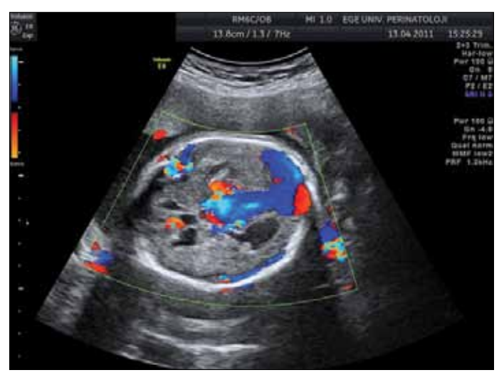
Figure 2. Turbulant blood flow in VGA through color Doppler mode

The current paper aimed to investigate the usefulness of 3D power Doppler sonography in a foetus diagnosed with VGAM during the second trimester. VGAM is a complex AV malformation that is usually characterized by multiple communications between the Galen vein system and the cerebral arteries (choroidal branches of posterior cerebral artery and the transmes-