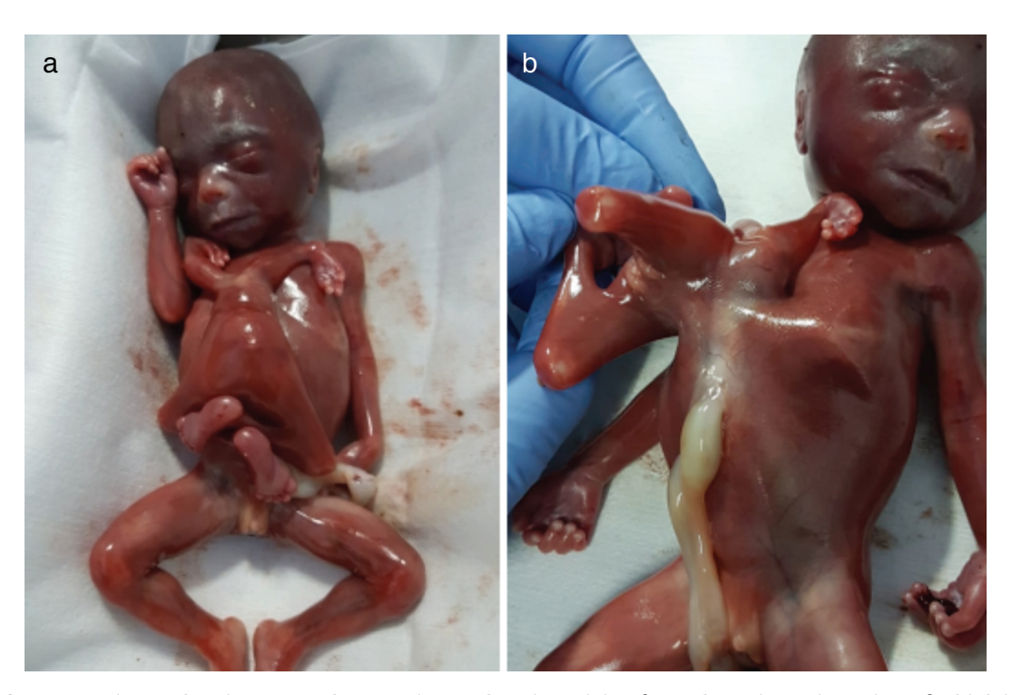
Figure 2. a) Gross specimen showing normal appearing male twin, arising from the epigastric region of which is the parasitic co-twin. b) Soft tissue pedicle connecting the parasite to the autosite and its relation to cord insertion on the autosite. Parasitic co-twin was also male with no skeletal muscle in the lower limbs