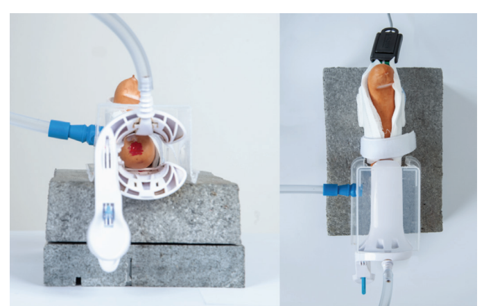
Figure 2. Construction of the conisation simulator

LEEP: Loop electrosurgical excision procedure