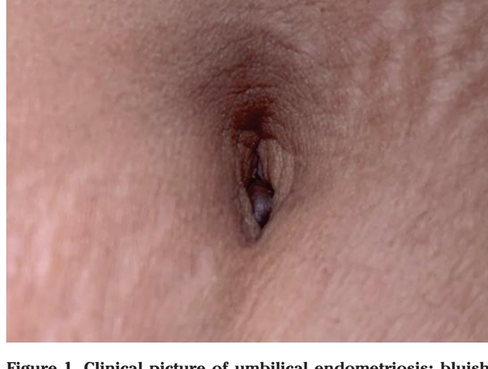
Figure 1. Clinical picture of umbilical endometriosis: bluishpurple firm umbilical swelling or nodule with associated cyclical pain

Received: 01 August, 2022 Accepted: 26 October, 2022