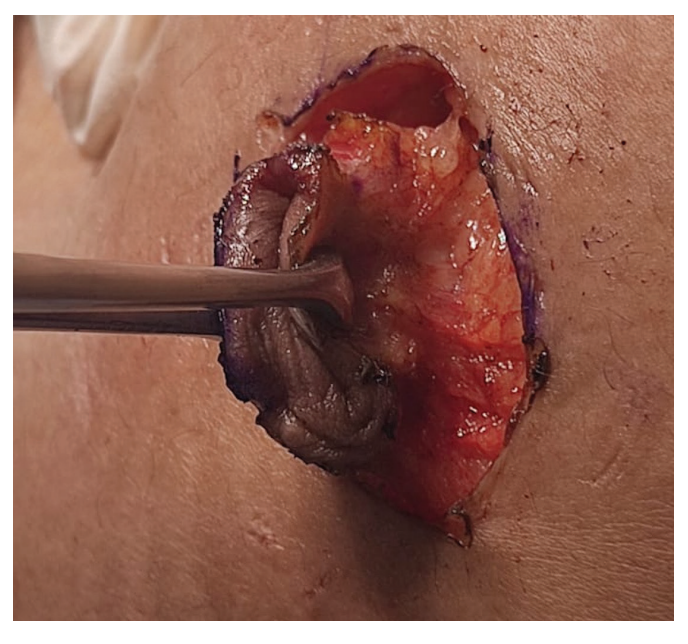
Figure 2. Radical omphalectomy